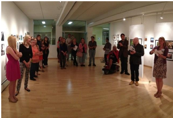
2013 High School Photo Exhibit Awards Presentations