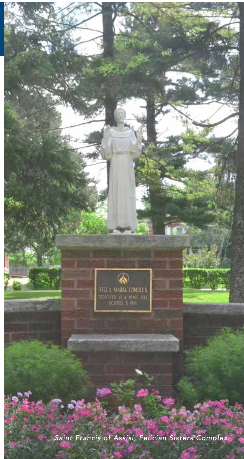
Saint Francis of Assisi, Felician Sisters Complex.