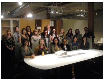
Students, faculty and alumni at the Krug Showroom

April was a very busy month at Villa. A group of 29 Villa students, faculty and alumni participated in an IIDA Buffalo City Center sponsored event, travelling to the Krug showrooms in Toronto for a CEU lecture by the Business and Institutional Furniture Manufacturers Association on Level, the sustainability certification program for furniture.