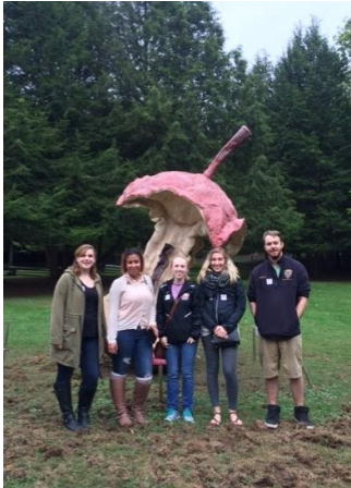
Students at Kentuck Knob and the Claes Oldenburg sculpture