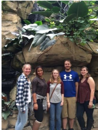
Students at Phipps Conservatory