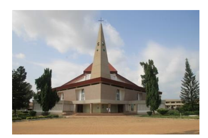
Cathedral of Sunyani, Ghana