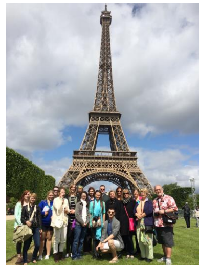
Students and Faculty at the Eiffel Tower in Paris, Day 1