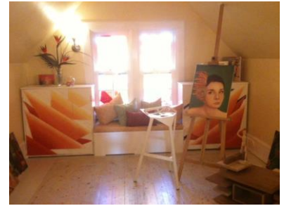
The Artist's Studio

This year Villa was thrilled to be awarded a unique space on the third floor of the Edward H. Webster House which we transformed into an Art Studio. Taking inspiration from the angled ceiling and the Delaware Park Rose Garden the room featured a custom fused glass window depicting an abstracted rose. Custom built radiator cover and corresponding storage unit complimented the window. A splatter rug was a crowd favorite. The adjacent closet was transformed into a ‘Fresh-mini Gallery’, featuring the work of our freshman class. Students were fundraising for two years in order to purchase furniture and supplies for the space. We were also grateful for donations from Ferguson Lighting Gallery, Wolf-Gordon and Schuele Paint. This was our most challenging space ever and was met with much critical acclaim.