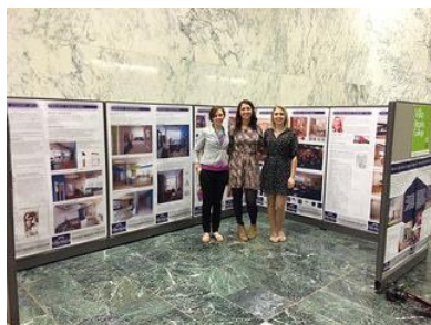
Villa students at their display in Albany, NY